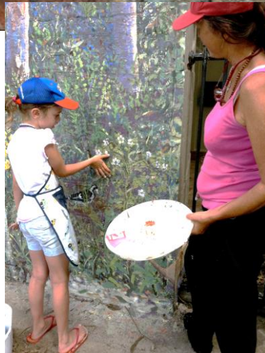
Young resident engaged in painting the mural