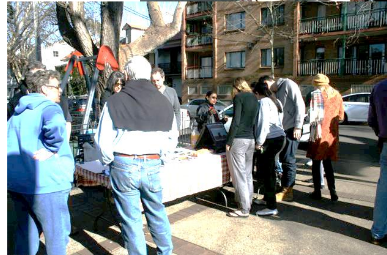
Engaging local community and residents living near the site