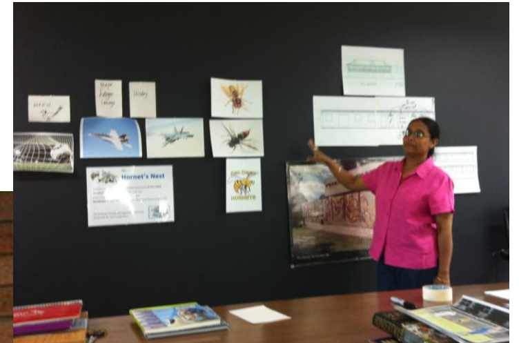
Presentation and workshop with Hornets football club members